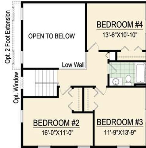
Second Floor With Optional 4th Bedroom